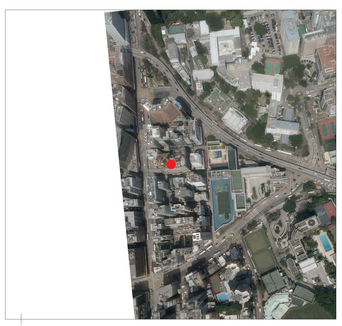
This blank area falls outside the coverage of the aerial photograph 鳥瞰照片並不覆蓋本空白範圍

Adopted from part of the aerial photograph taken by the Survey and Mapping Office of the Lands Department at a flying height of 2,000 feet, Photo No. E220039C, date of flight: 20 March 2024.